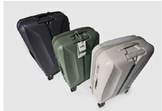
Hemp luggage, produced in EU

By now, everyone on earth is aware that, whilst plastic is tremendously useful, the sheer amount of this synthetic material in our lives has become an environmental problem both at sea and on land, with a demonstrable impact on our environment and ecosystem. Governments have begun to acknowledge this and there is a growing expectation amongst the citizens of Europe that there will be some form of intervention.