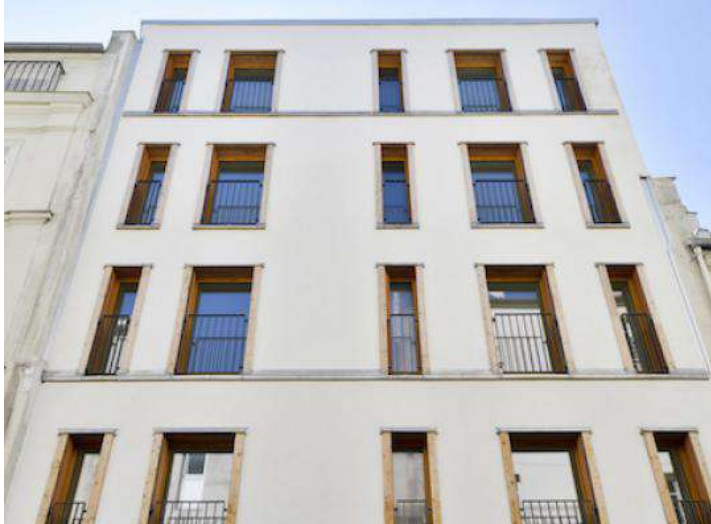
Examples of a hempcrete building in Paris, France

The examples of hemp in the construction industry keep multiplying and gaining in efficiency. A three-story building at Bath University was constructed using a hemp-lime envelope and was so effective that they switched off all heating, cooling, and humidity control for over a year, maintaining steadier conditions than in their traditionally equipped stores, reducing emissions while saving a huge amount of energy. Very