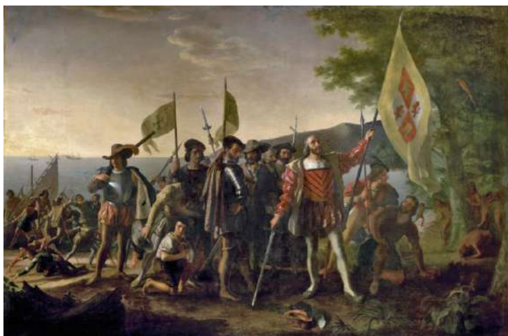
Landing of Columbus, John Vanderlyn (1775-1852)

A huge consumers market existed for hemp fibres until after World War II . In the 1930s Russia's hemp area sown was almost 700,000 hectares, providing for 40% of Europe's hemp needs. In comparison, Italy and Yugoslavia accounted for up to 100,000 hectares each. Currently the EU combined barely grows 50,000 hectares.