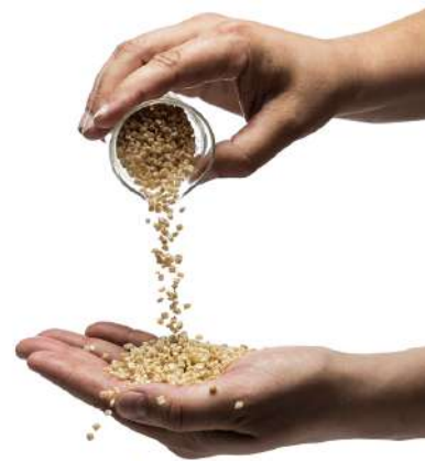
Hemp-based plastic ready to be molded

Furthermore, hemp is one of several plant based raw materials that can be used for compostable packaging which will contribute to a significant reduction in plastic waste. In 2017, the EU waste plastic mountain was reported as 25.8 million tons; around one third of this waste was recycled, with the remaining two thirds being incinerated or landfilled. Of the 51 million tons of new plastics placed on the EU market in 2018, approximately 40%, or 20 million tonnes, was used for packaging materials. The next step for the hemp sector is to submit an application for registering hemp fibre as food contact material.